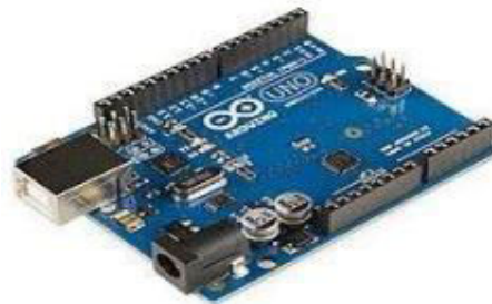
Fig. 1.1 Arduino

• Arduino: The ESP8266 is a pocket-friendly and compact microcontroller that has a built-in Wi-Fi module and the capability to operate as both a TCP/IP stack and a microcontroller. This microcontroller is produced by a Chinese company situated in Shanghai. Its cost-effectiveness, small size, and integrated Wi-Fi module make it a perfect option for linking an Arduino board to the internet, cloud server, and mobile apps.